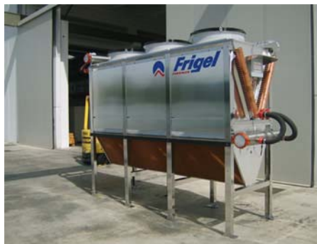
The Ecodry's modular components and design makes installation and expansion less complicated and more affordable than conventional cooling tower systems – and there's no need to mount components on the roof.

We've opened up an additional month's capacity using this system.